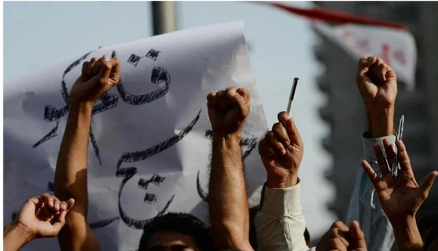
A representational image shows people during a protest.

By Our Correspondent | November 01, 2023